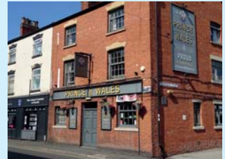
Prince of Wales