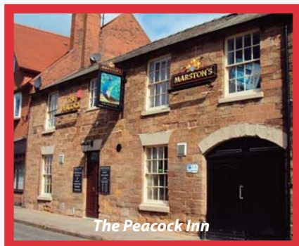
The Peacock Inn