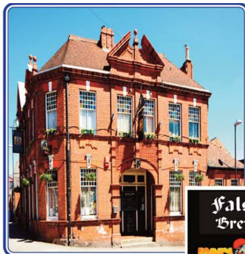
The FALSTAFF 74 Silverhill Road, Derby DE21 6UJ