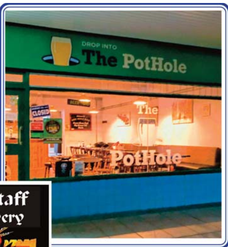
The POTHOLE Park Farm, Allestree Derby DE22 2QQ