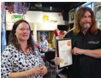
Derbyshire North Pub of the Year Feather Star, Wirksworth

T his year's best pubs in Derbyshire where both in the nearby vicinity of Derby and well within the area covered by Derby Drinker.