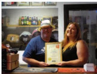
Derbyshire South Pub of the Year The Angels, Belper

Derbyshire North's winner is the Feather Star in Wirksworth,