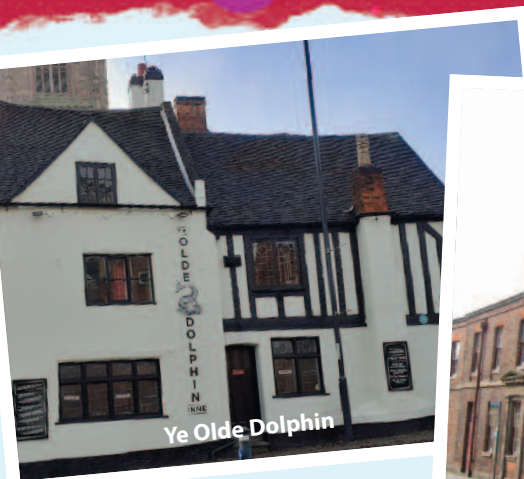
Ye Olde Dolphin

As Derby Pub Gardens come into their own