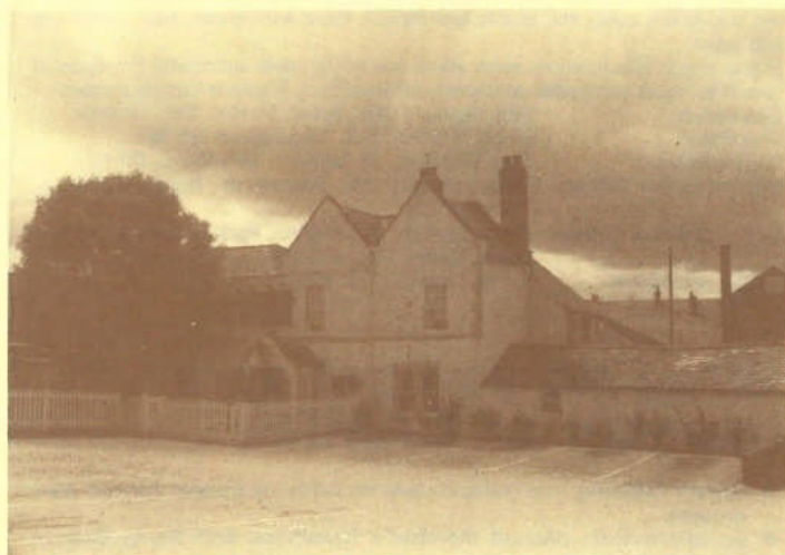
Ye Olde Spa — Award winning Abbey Street local.