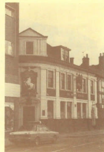
Fine Mild — The White Horse