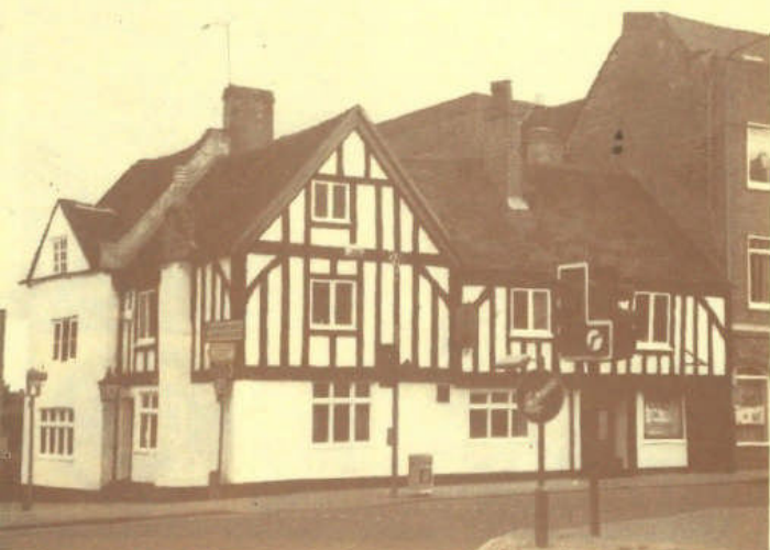
The Dolphin, Queens Street — Derby's oldest pub