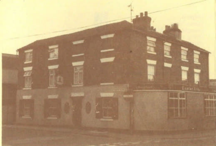
Exeter Arms — Snug and fireplace saved from planners.