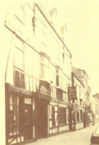
Bell Hotel — Bass in Tudor Bar